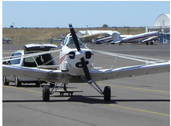
That's why we call them Tow-Planes Story of Page 5