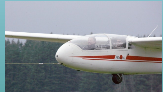
Launching one of our Blantik L-23 trainers at Arlington

For more information click on the Contact Us link on our website